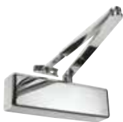
Polished Nickel Plate (PNP)