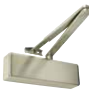
Satin Nickel Plate (SNP)