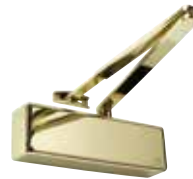
Electro Brass (PVD)