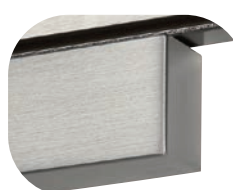
Square Cover (SQ)