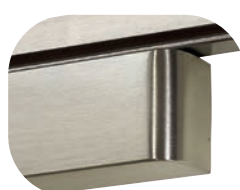
Semi Radius Cover (SR)