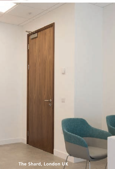
The Shard, London UK