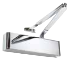
Polished Nickel Plate (PNP)