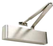
Satin Nickel Plate (SNP)