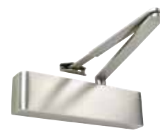
Satin Stainless Steel (SSS)