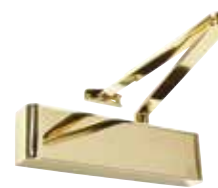
Electro Brass (PVD)